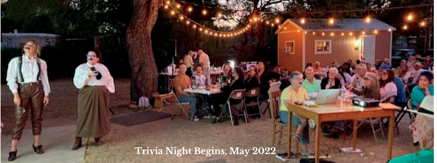
Trivia Night Begins, May 2022

346 Duquesne Ave. Patagonia, AZ 85624 - 520-394-2010 - www.patagoniapubliclibrary.org