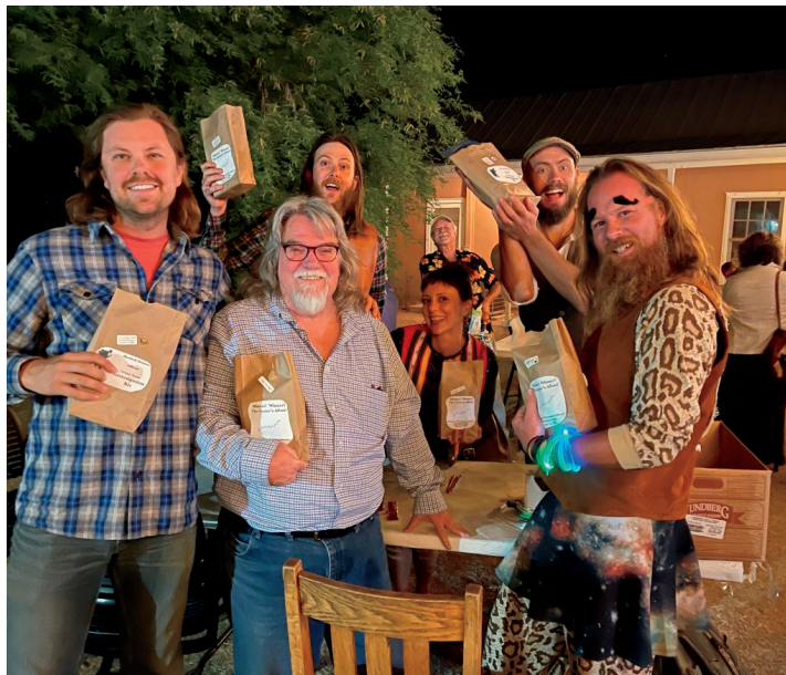
Here is our winning team!